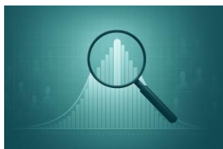
Amplification of the Average